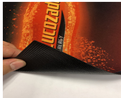
Anti slip backing