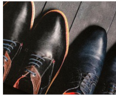
Photographic HD print quality