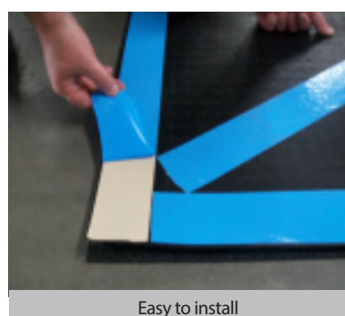
Easy to install