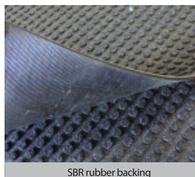
SBR rubber backing