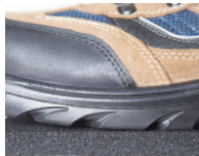
Thickness 13 mm