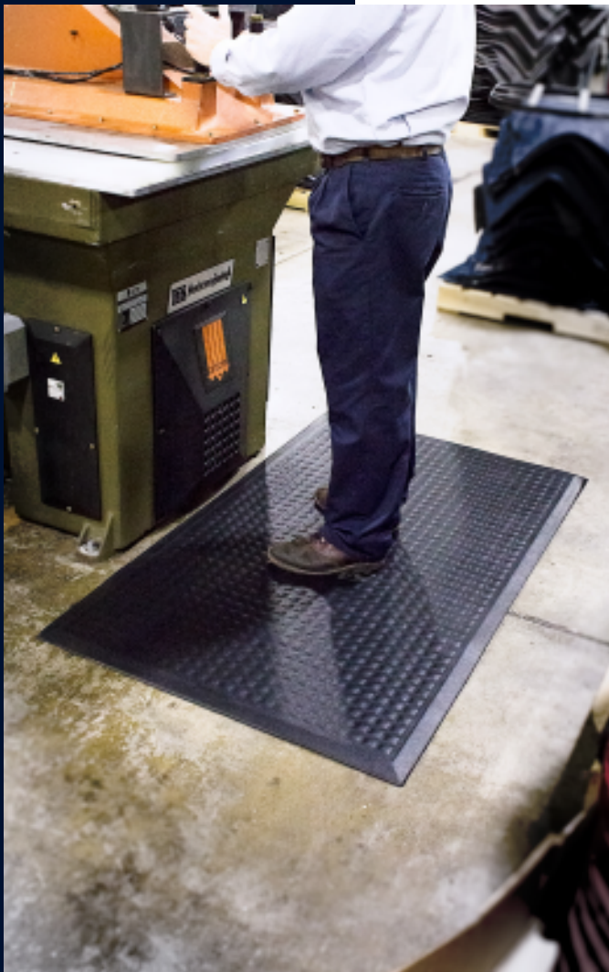
Standard Sizes (cm)